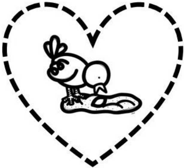
Seed sown along the path.