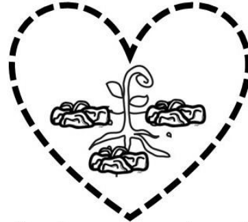
Seed sown on rocky soil.