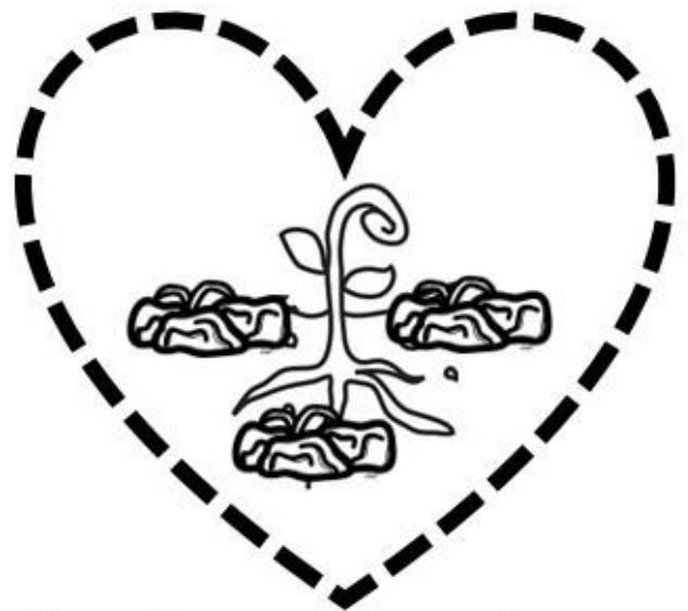
Seed sown on rocky soil.