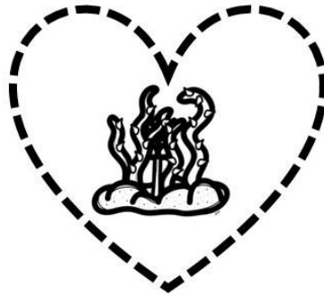
Seed sown among the thorns.