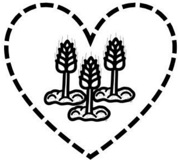
Seed sown on good soil.